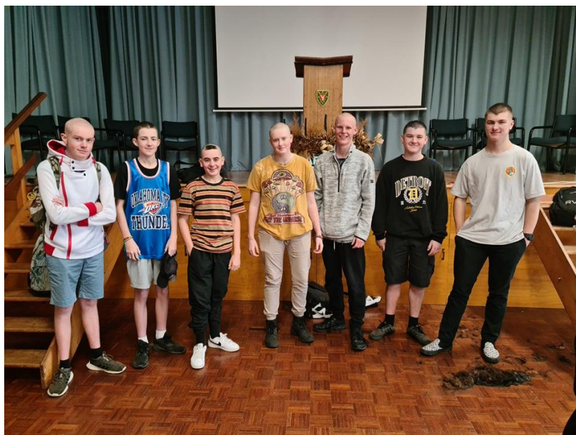
Our wonderful group of students who shaved their heads to raise money for Child Cancer.