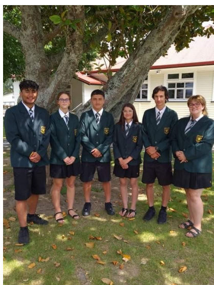
Excelling as a creative, innovative, can do community.