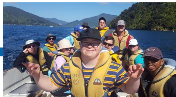
Outward Bound Adapted Courses