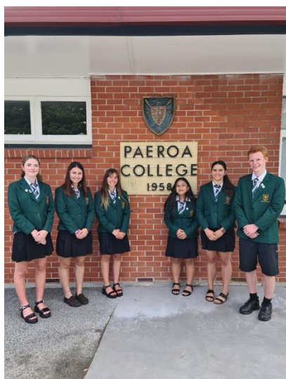
Excelling as a creative, innovative, can-do community